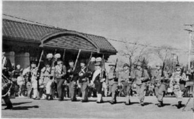
Phelps Camp #66 and their "Parade of the American Soldier" in last year's Veteran's Day Parade in Branson and Springfield, Missouri.