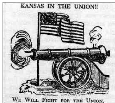
Drawing of "Old Kickapoo"