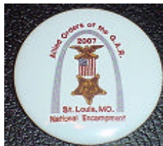
Encampment Button logo's on them $1.00 + shipping