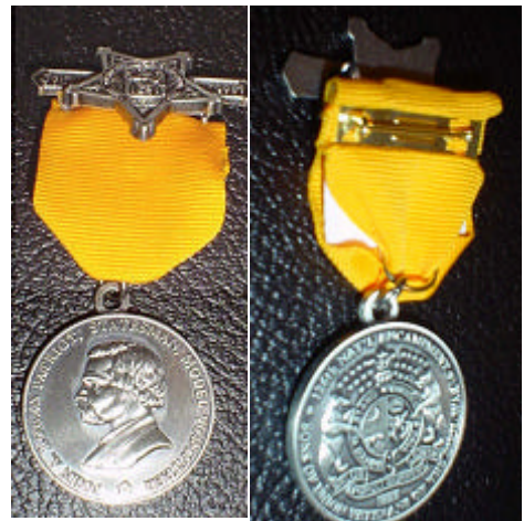
Logan Medals limited supply and they are numbered $15.00 + shipping

SPECIAL OFFER: LOGAN MEDAL, ENCAMPMENT ARCH MEDAL & ARCH BUTTON $20.00 + shipping