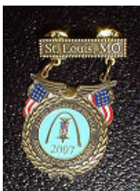
Encampment medals with arch logo on with arch and GAR medal them $7.50 + shipping