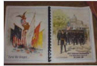
Encampment Book w/historical info. $5.00 + shipping