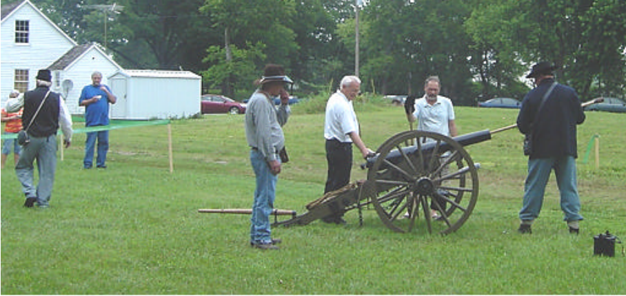
Photo: Members of the camp preparing to fire Fort D Cannon (loaned to us by the Cape Girardeau Convention & Visitor's Bureau)

citizens were that the reenactors were very knowledgeable and were willing to share their knowledge with everyone that came their way.