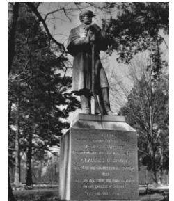
Grant Monument erected in 1886 on what are now the Ste. Marie du Lac Catholic Church grounds, Ironton, MO.

*Photos of Lindsay & Monument courtesy of the Iron County Historical Society