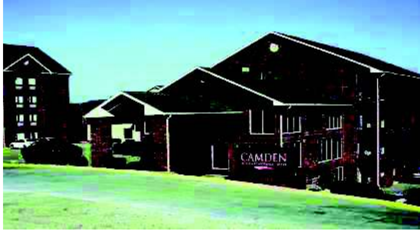
CAMDEN HOTEL AND CONFERENCE CENTER

275 Tanger Blvd. Branson, MO 65616 Reservations call (417) 334-8404 or 800-335-2555 Tell them you are with The Sons of Union Veterans of the Civil War Rooms are $70.00/Nt. for 2 Queens or $75.00/Nt. for a King Cut-off reservation date is May 1, 2017