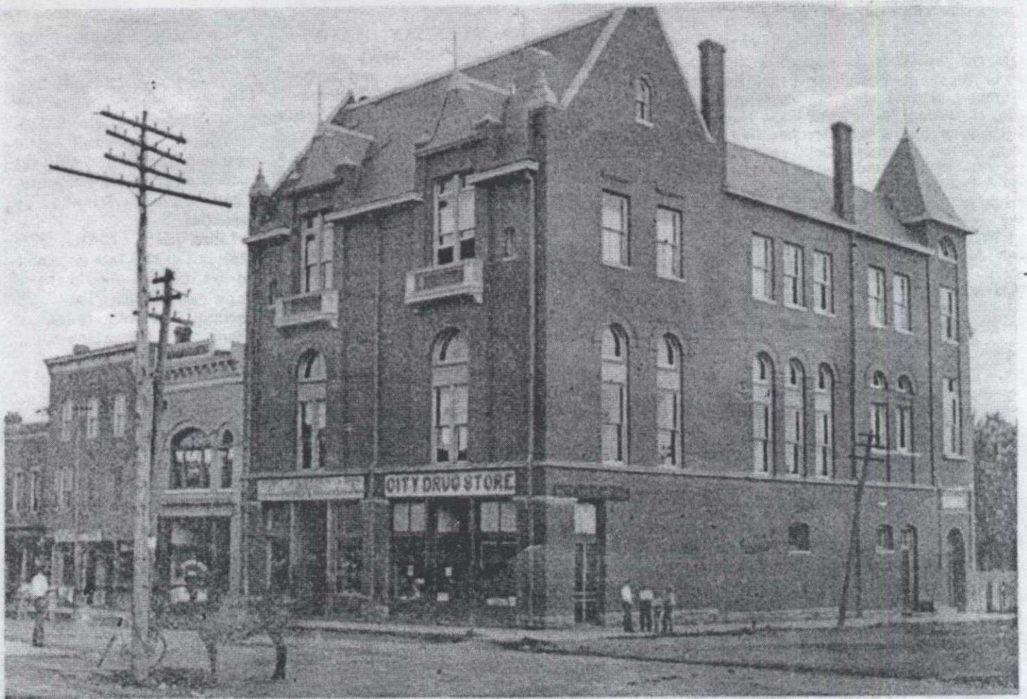
CITY DRUG STORE.JPG

LONG, LONG AGO — There was a horse tied to the telephone pole next to a bicycle, and a group of men were reharsing the day's events near the side window of the City Drug Store, but this is the way the southeast corner of Columbia and Washington looked in Farmington more than a few years ago. The building, a three story skyscraper, was the Oddfellows Building and stood