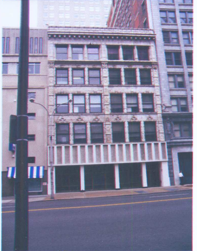
918 GRAND KCMO