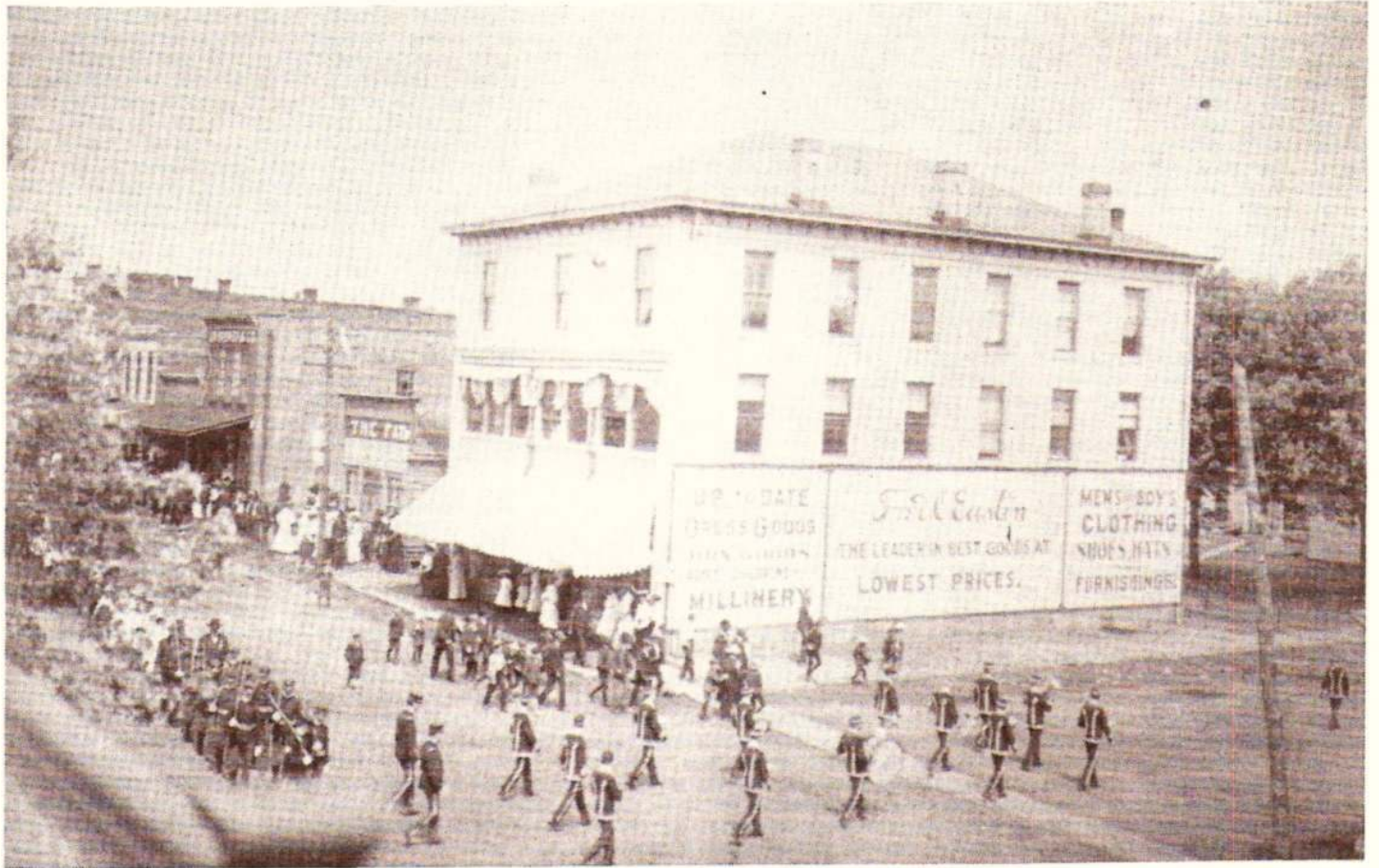
Parade of G.A.R. in Greenfield