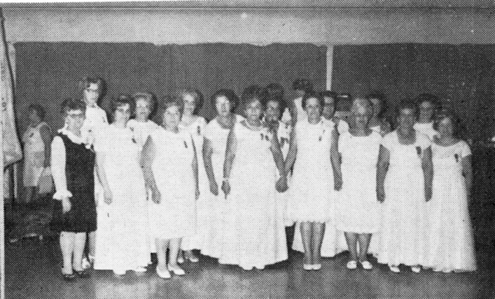
Shown above is a group of officers of both the SUVCW and Auxiliary at St. Louis.