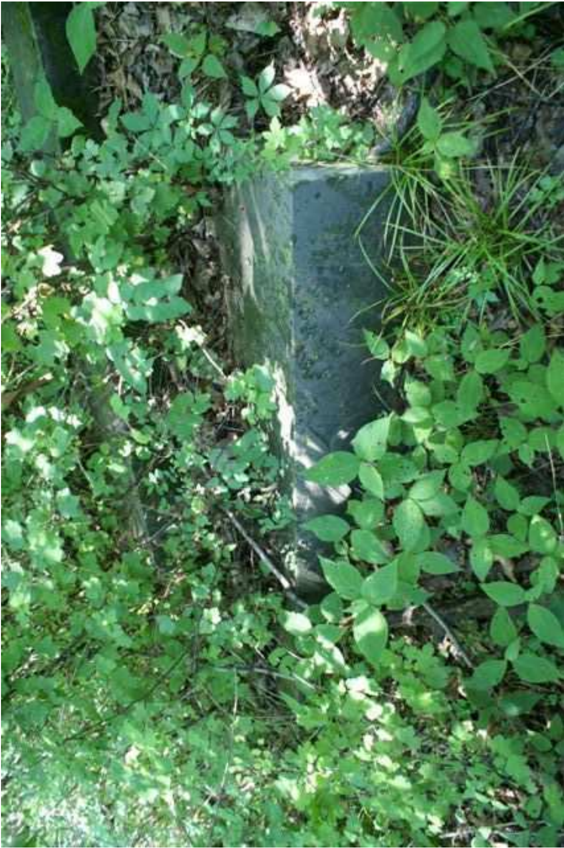
Prior to restoration