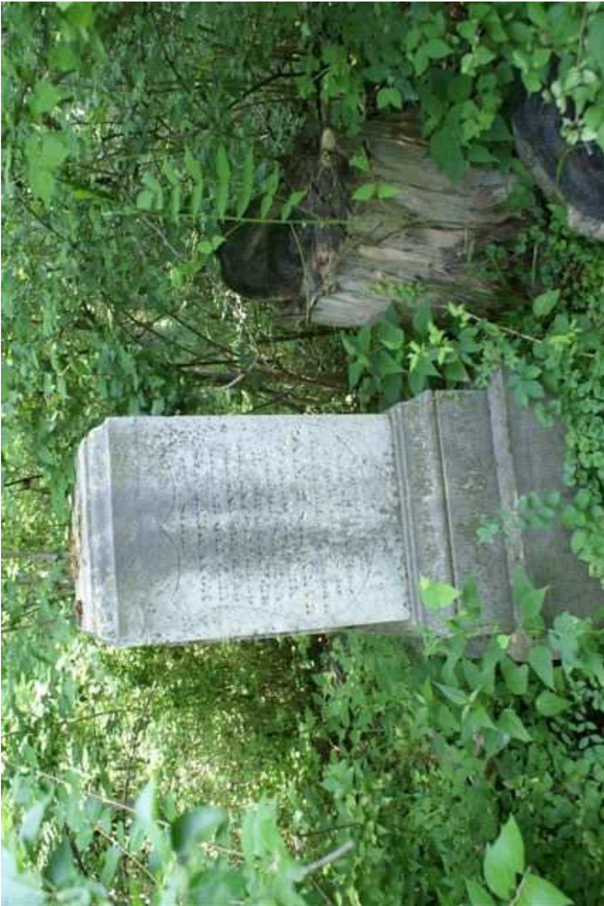
Prior to restoration