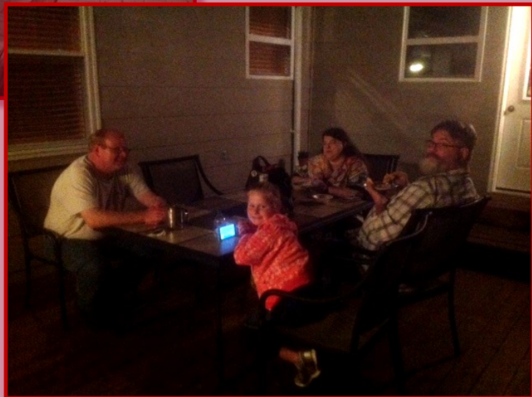
The Warrens and the Burds