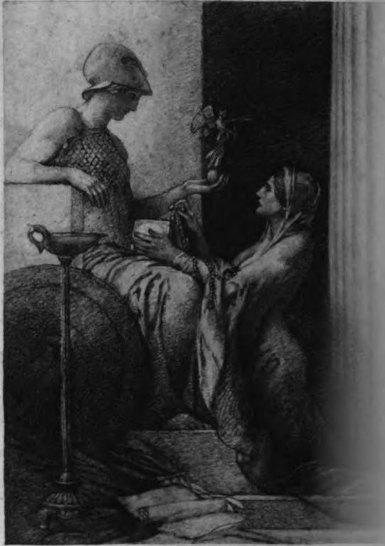
LELAND · STANFORD · JUNIOR · UNIVERSITY