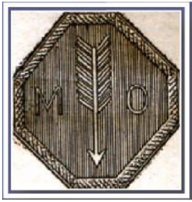
Department of Missouri Corp Badge