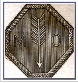
Department of Missouri Corp Badge