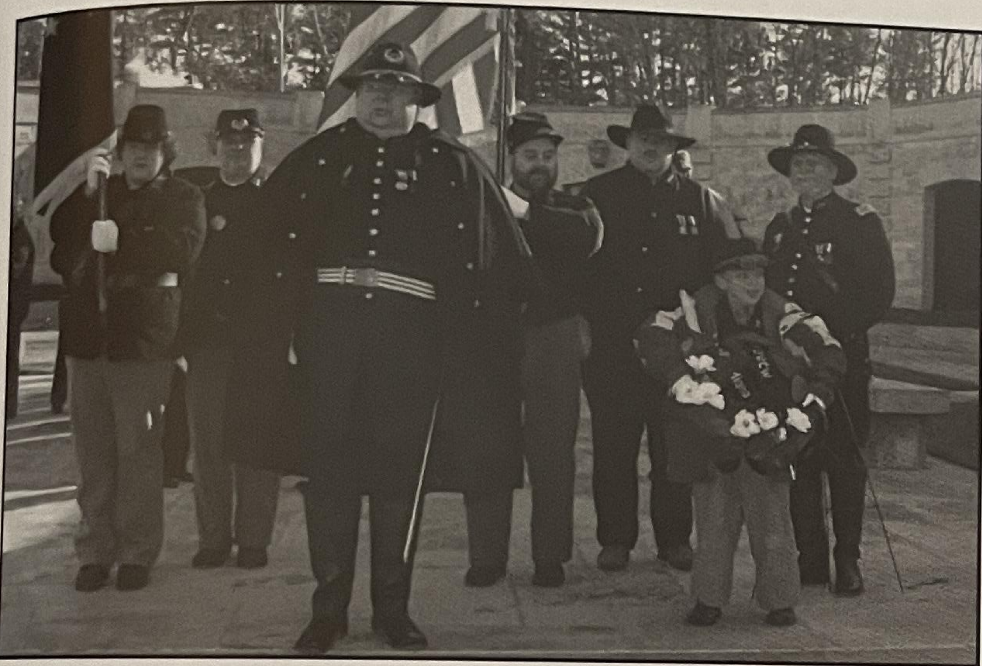
Gathering at Memorial Hall

During the ceremony, which included period music, the Sons provided a color guard and laid wreaths at the grave of Lincoln's mother, Nancy Hanks Lincoln, who died a couple of years after the family moved to Indiana from Kentucky.