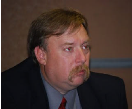
"Where do they find these boring guys"

The editor has taken the liberty to try and explain what it looks like the individuals in these photo's are thinking.