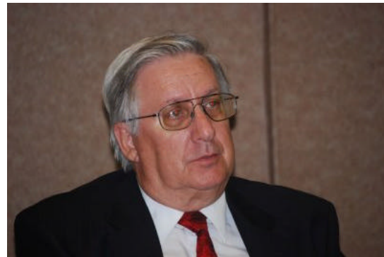
"Will this ever end?"