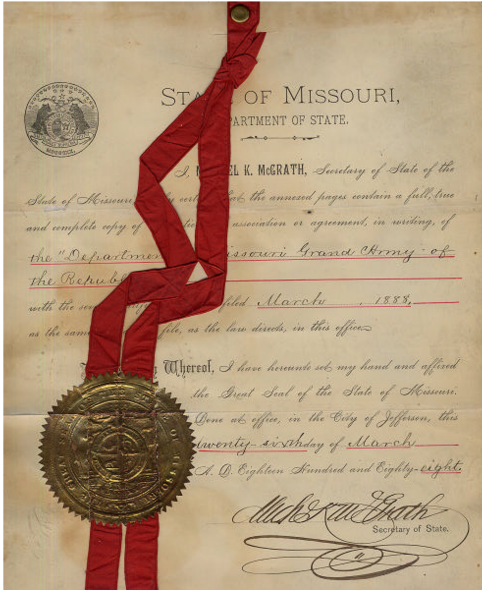
Our Original Department of Missouri GAR Charter

NEWSLETTER OF THE DEPARTMENT OF MISSOURI - SONS OF UNION VETERANS OF THE CIVIL WAR