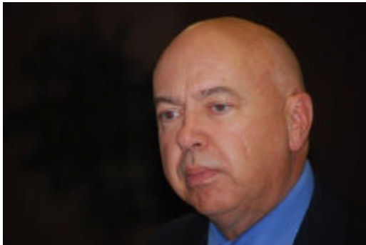
"Now that I am Department Commander, I wonder if I can have him shot to put him out of our misery."