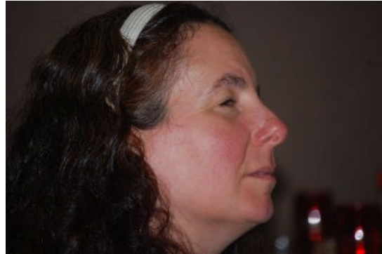
"I wish I had those toothpicks for my eyes."