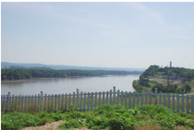
view from the cemetery sight.