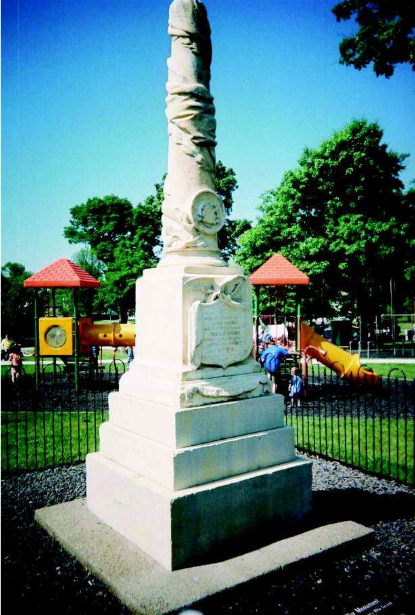
The Monument 1914