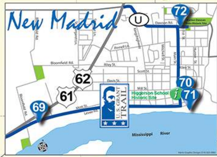
New Madrid New Madrid Civil War driving trail maps are available at the Higginson School Historic Site.