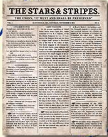
THE STARS & STRIPES "THE UNION, 'TIS MINE AND SHALL BE PRESERVED"