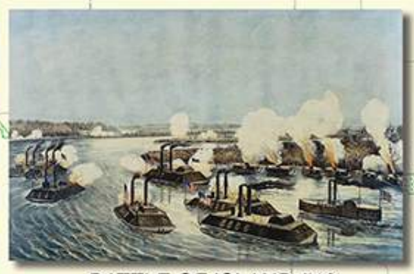
BATTLE OF ISLAND #10