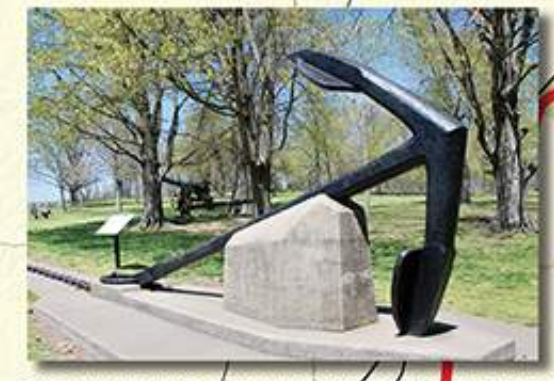
COLUMBUS-BELMONT STATE PARK