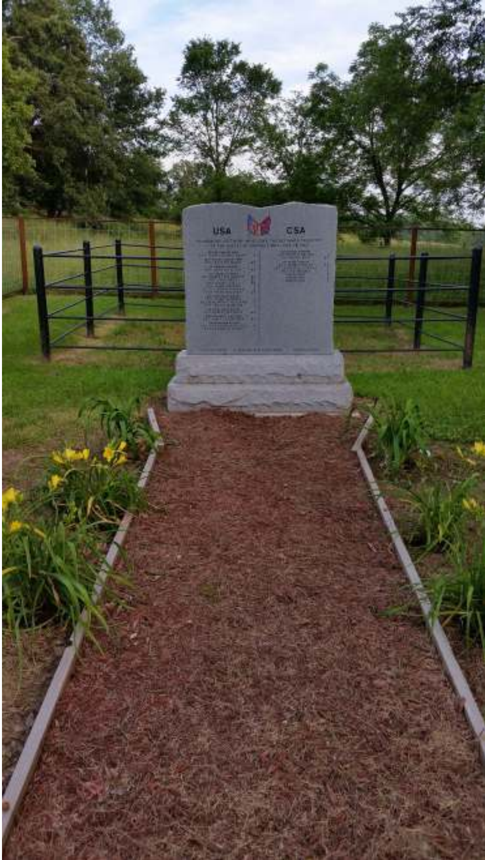
Moore's Mill grave memorial. 54 wide x 59 high. N38.916904, -W91.857807