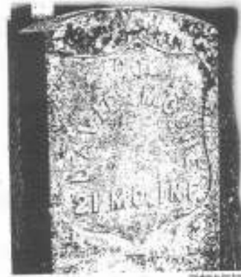
LOCAL STONE - This headstone tells of a Civil War veteran's quest. There is an effort to start a local chapter to honor Civil War Veterans.