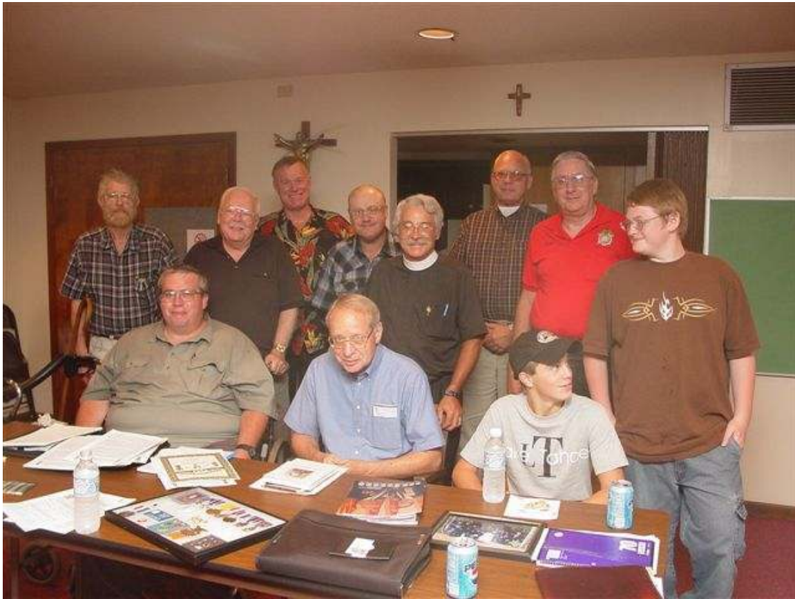
First Meeting Col David Moore Camp 70 at Canton Aug 17 2006 (2)