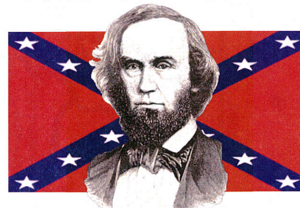
Missouri Governor Claiborne Jackson

Passport book and program developed by Fry's Lyon Foundation and endorsed by the Missouri State Parks