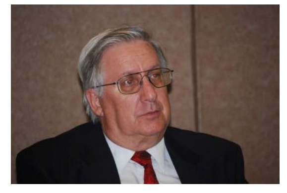
"Will this ever end?"