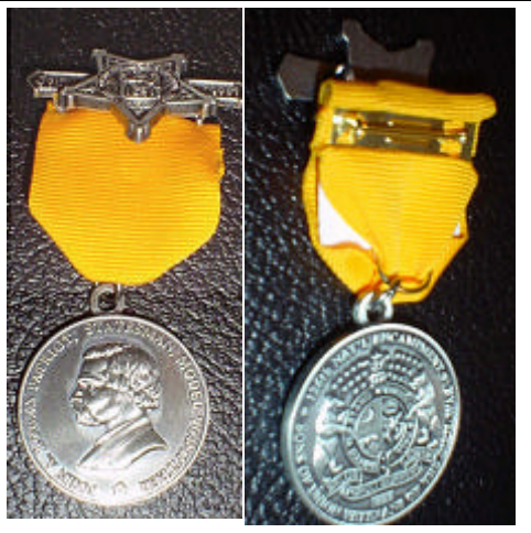
Logan Medals limited supply and they are numbered $15.00 + shipping