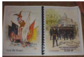
Encampment Book w/historical info. $5.00 + shipping