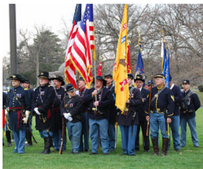
President Lincoln 18 April 2009