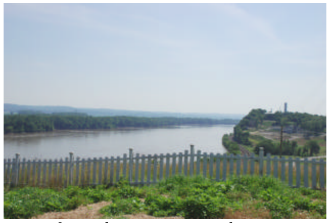
view from the cemetery sight.

On May 15-16, 2010, Co C, 5th Regt. MO Vol Cavalry, SVR will host with the Dierberg Foundation, a living history weekend in Hermann, Missouri. The highlight of the weekend