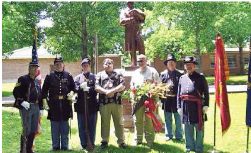
Grant Ceremony at Ironton