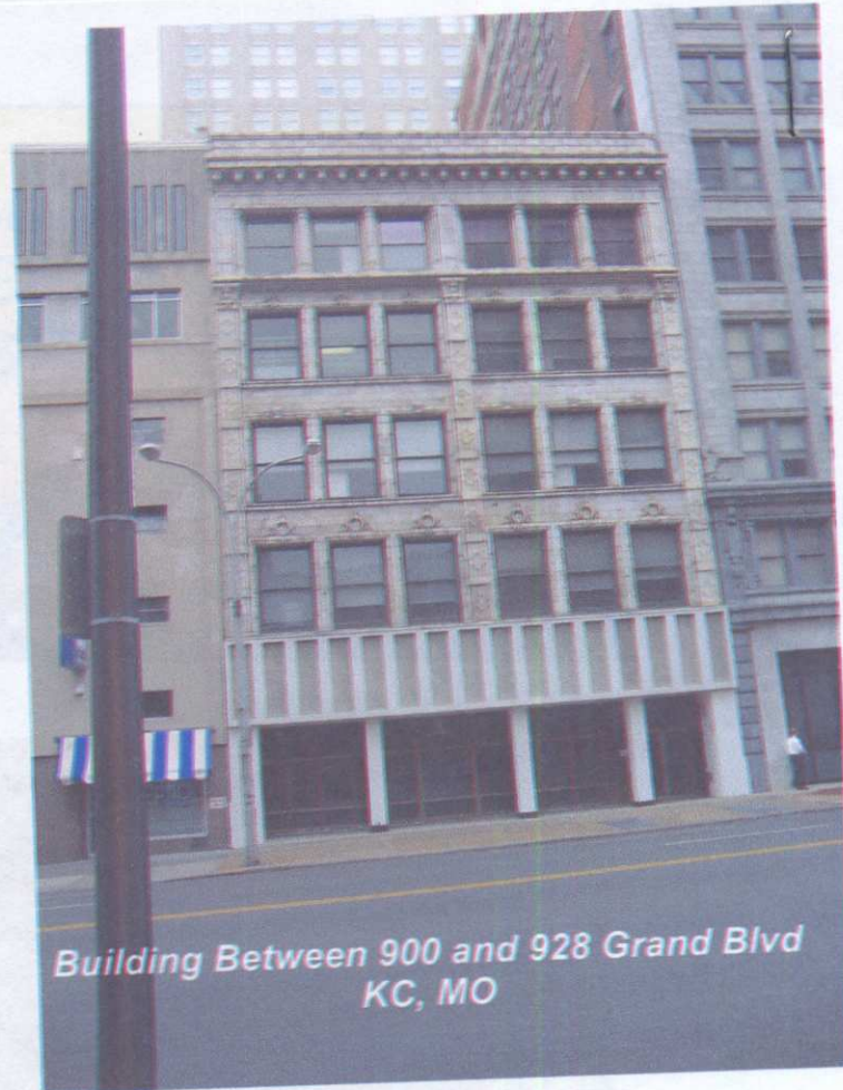
Building Between 900 and 928 Grand Blvd KC, MO

This map is informational only. No representation is made or warranty given as to its content. User assumes all risk of use. MapQuest and its suppliers assume no responsibility for any loss or delay resulting from such use.