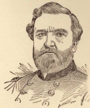
GEN. GEORGE H. THOMAS