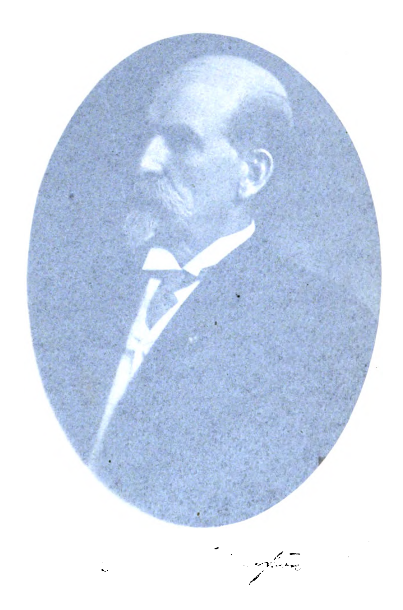
Digitized by Google