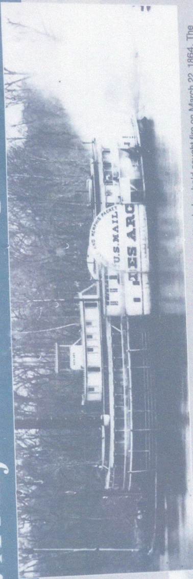
The steamboat Des Arc was moored at DeValls Bluff when cotton in her hold caught fire on March 22, 1864. The U.S.S. Signal towed her across the river to protect other vessels docked nearby and, when the flames grew out of control, sank her with cannon fire. The Des Arc was later raised and continued serving as a White River packet until 1871.