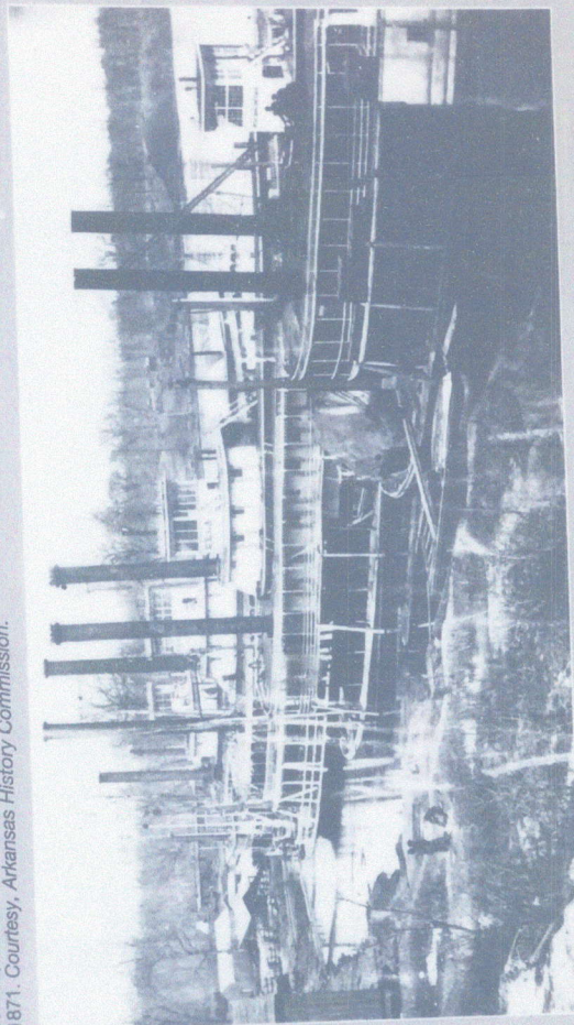
Steamboats carried cargo to DeValls Bluff, where it was shifted to the railroad. Here, the Pocahontas, Ella and Emma No. 2 are docked at DeValls Bluff.

This project is supported in part by a grant from the Arkansas Humanities Council and the Department of Arkansas Heritage. Other sponsors are the Arkansas Civil War Roundtable, the Arkansas History Commission, the City of DeValls Bluff and the Bill & Sharon Arnold Family Foundation.