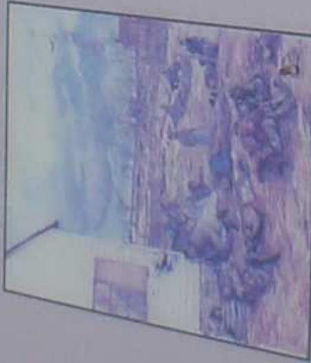
January 9, 1863, the morning after the battle