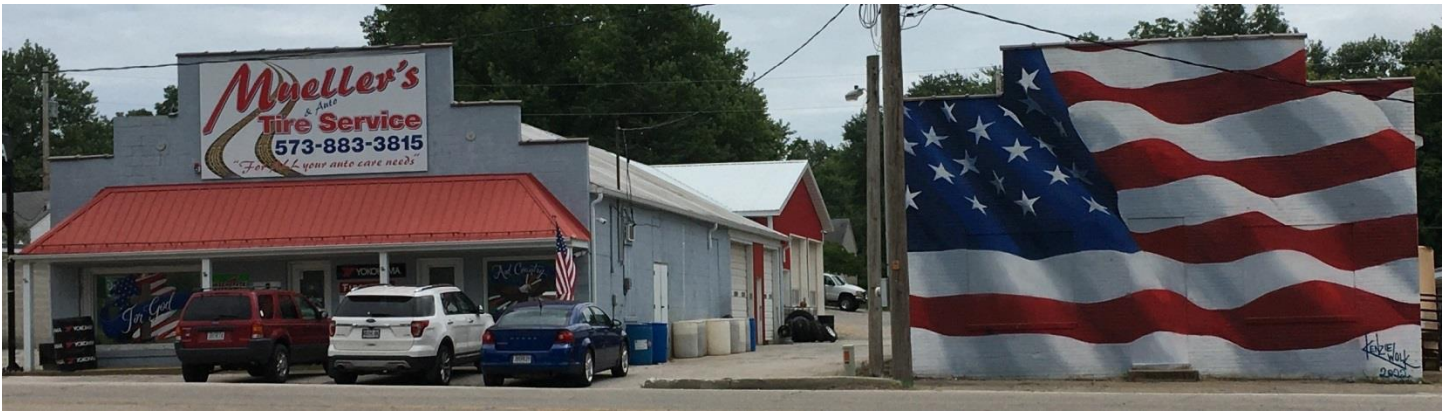
Photo shows business. Even the cars lined up waiting to be repaired on the next Monday are red, white and blue. The Mueller Tire and Auto Service, not only met the requirements but their business buildings speak volumes of their patriotism and love for our Country.