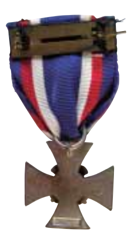
Type VI Reverse