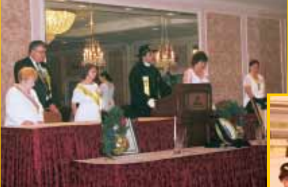
LEADING THE MEMORIAL SERVICE