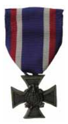
Type V Obverse