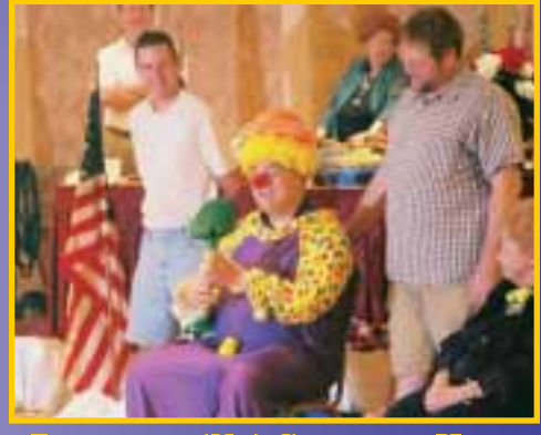
Fun at the (No) Courtesy Hour