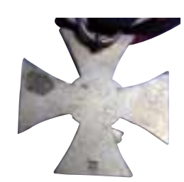
Type VIII Reverse