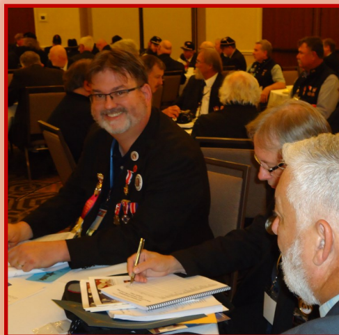
Our delegates hard at work

monument in Sante Fe, Arizona, which was erected by the GAR and whose ownership passed to the SUVCW. The local authorities and federal government want it taken down. The monument is fragile and was toppled in 2020 by miscreants. The resolution was to give a quit claim deed to the federal authorities, which would allow them to do with it as they wish.