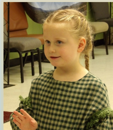
One of the newest Auxiliary members takes her oath