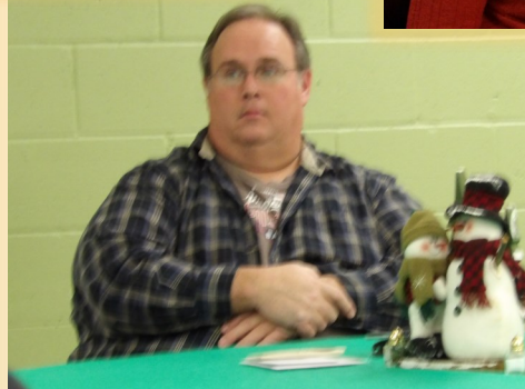
Some more party photos