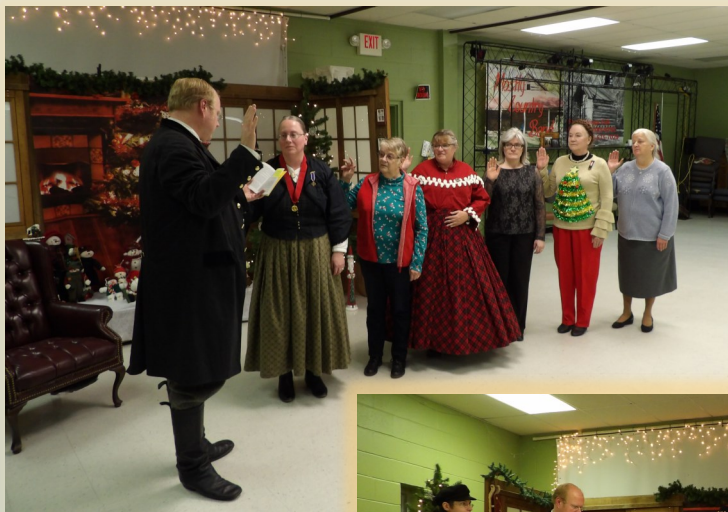
PDC Warren installs the officers of the Auxiliary and the Camp.