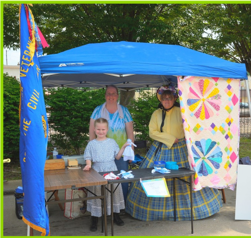
Sisters and Brothers awaiting the crowds