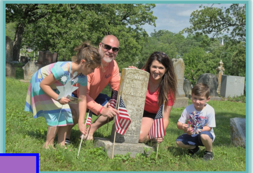
Engaging the public