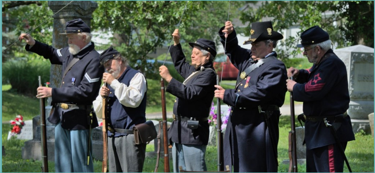
Fraternity, Charity, and Loyalty: Brothers at the Ready from the Fletcher and St. James Camps