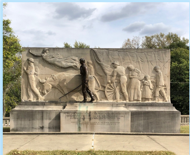
Lincoln monument - banks of the Wabash