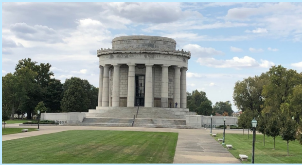
George Rogers Clark Memorial

there. Lunch was catch-as-catch-can. Afterwards, a few of us traipsed across the Wabash River bridge into Illinois, where there is a monument to Lincoln coming into the state. It was erected in 1938 by the Daughters of the American Revolution. It reads “In the late winter of 1830 a few weeks after his 21 st birthday / Abraham Lincoln passed this way with his father's family / entering the state of Illinois for the first time.”