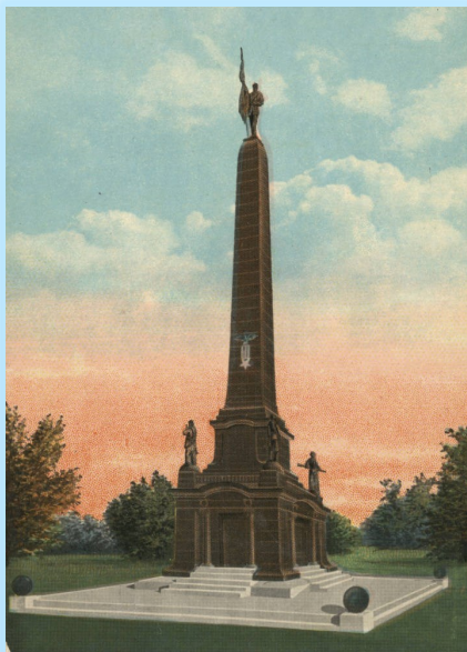
Postcard of the GAR monument and some members of the CRA

Checking in, everyone received their welcome packet, and evening fellowship on Friday was spent at a local Mexican Restaurant.