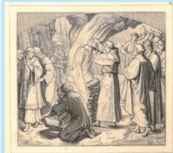
Luther burns the Pope's papal pull and his Deep Dish Pizza recipe

The stranglehold on provel production in Rome would eventually come to an end. Even after various sackings by various barbarians, the secrets of provel were well guarded. This would all change during the Protestant Reformation. A rather obscure monk named Martin