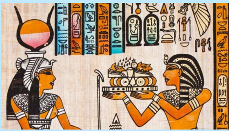
An ancient Egyptian treating his lady right with a plate of provel

Pliny the Elder was known to love provel cheese for lunch. Plato was said to have eaten it for breakfast. Some even say Hannibal came over the Alps just to get at the heart of provel production in ancient Rome. Perhaps true and perhaps not. But what follows is roughly what we know on the subject.