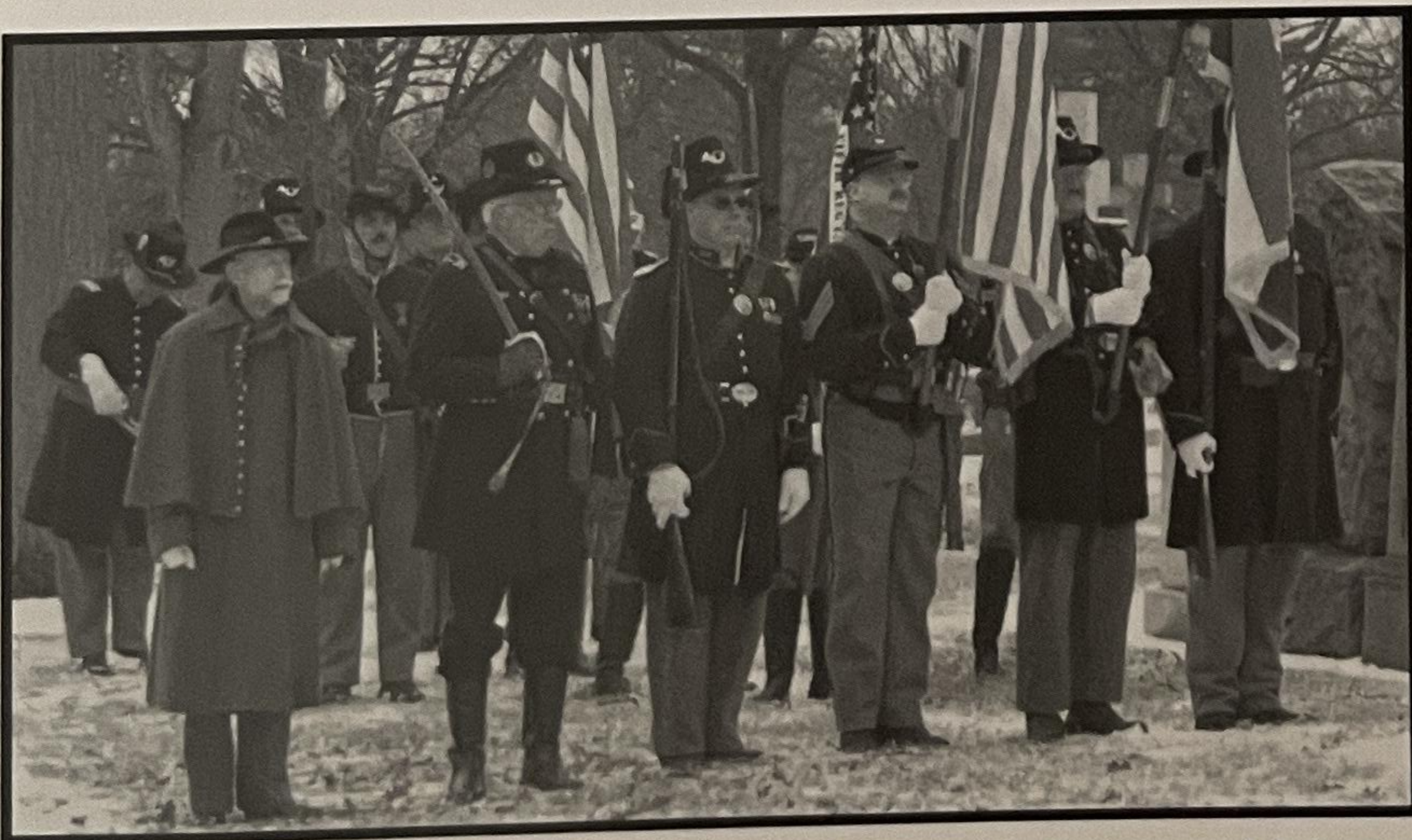
Pictured: Members of Co. C, 34th Illinois Infantry and 5th Missouri Cavalry serve on the color guard.

Nineteen members of three SVR units participated in the 29th annual Gen. Wm. T. Sherman Birthday Celebration on February 24th. Co. A, 2nd MO Inf., Co. C, 5th MO Cav. and Co. C, 34th IL Inf. braved the weather to pay respects to the General's memory.