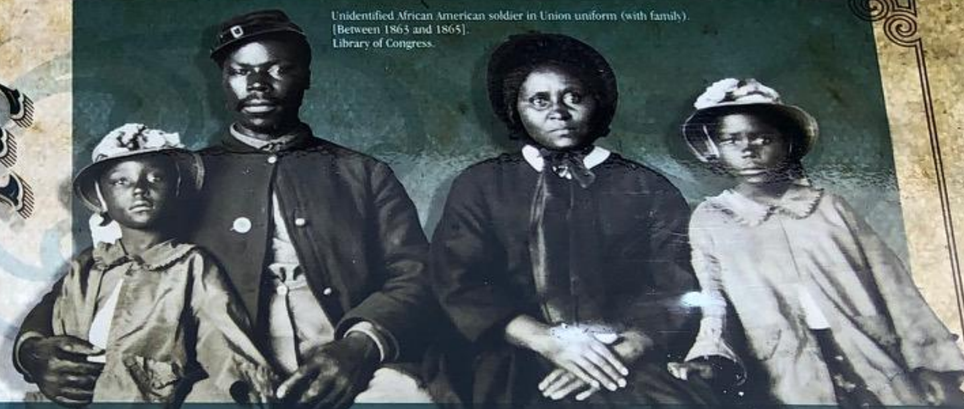
Unidentified African American soldier in Union uniform (with family). [Between 1863 and 1865].

How did the Civil War affect your ancestors?