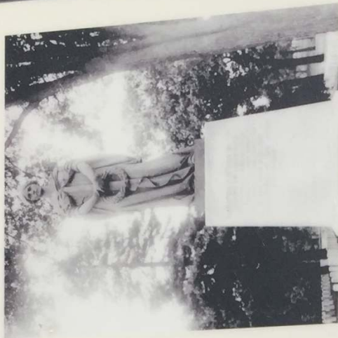
Minnesota Monument in 1933.

Throughout the war Jefferson Barracks served as a hospital. The army converted existing buildings and erected new ones to serve as medical facilities. By the end of 1862, more than 5,000 sick and wounded had been treated at Jefferson Barracks General Hospital. In excess of 18,000 Union soldiers passed through it by the time the war ended in 1865.