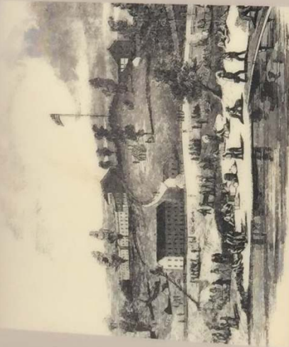
Jefferson Barracks as it appeared in 1861. Frank Leslie's Illustrated Newspaper (June 29, 1861).