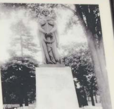
Minnesota Monuments in 1911.