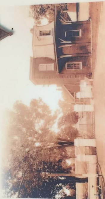
Former cemetery entrance and gatehouse/office, 1933. The superintendent's lodge is visible beyond the gate.

In the early twentieth century, Annie Wittenmyer Tent No. 3, Daughters of [Union] Veterans, erected a monument to the unknown Union dead interred at Jefferson Barracks.