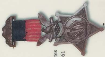
Civil War Army Medal of Honor Gettysburg National Military Park