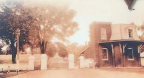
Entrance cemetery entrance and gatehouse, 1911. The superintendent's lodge is visible beyond the gate.