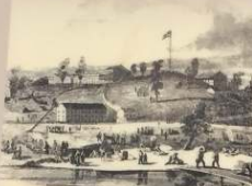
Jefferson Barracks as it appeared in 1861. Frank Leslie's Illustrated Newspaper, June 29, 1861.