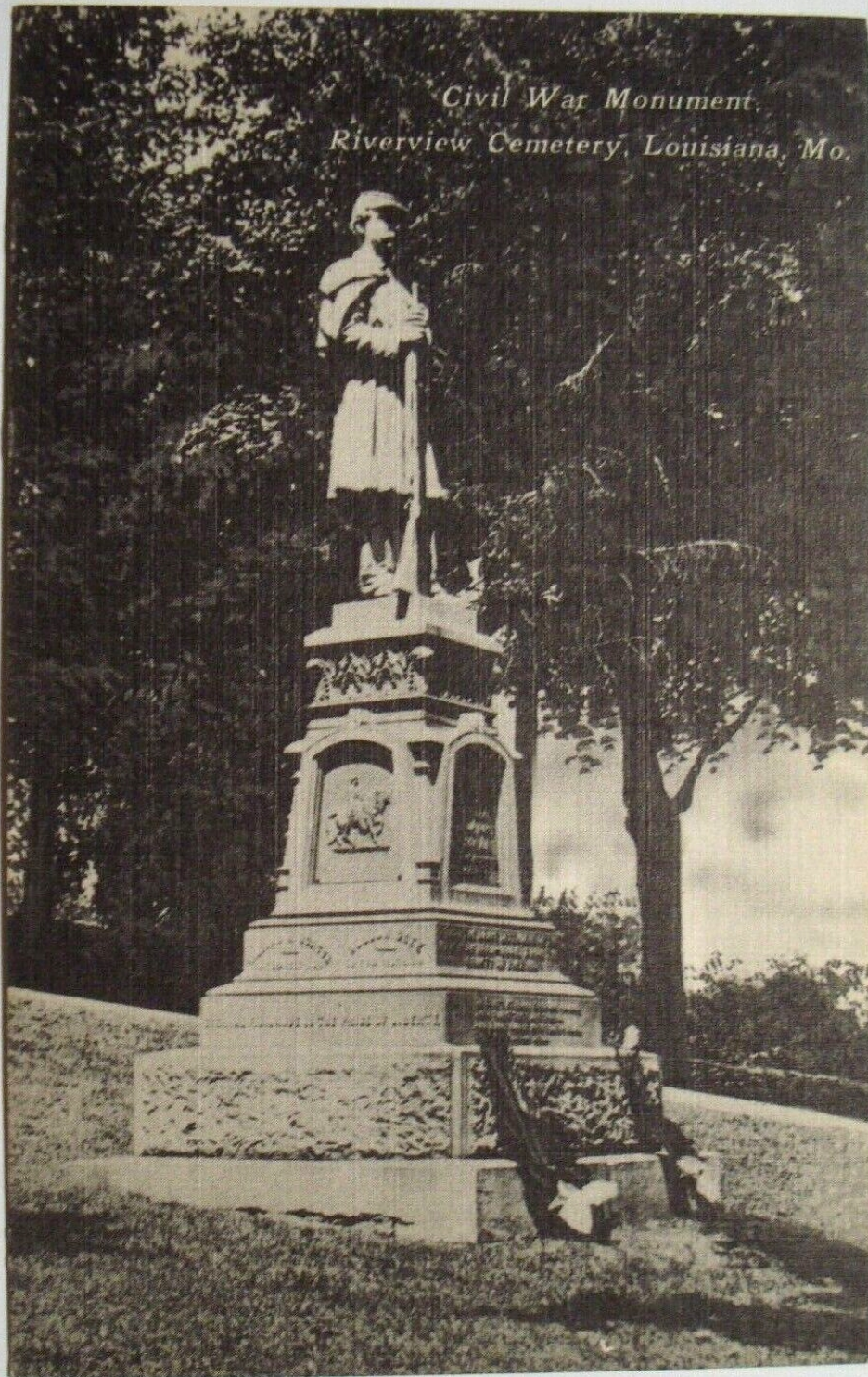
Postcard Tichnor Quality Views by Tichnor Bros, Inc, Boston, MA circa 1915-1950 [before showing zipcodes on the back of postcards]