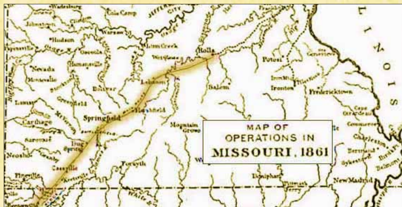
The Springfield and Wire Roads

Pacific is famous for its association with America's mother road, Route 66. Before the age of automobiles this route to the southwest was known primarily as the Springfield Road. Before the Civil War, a military telegraph line was laid from Jefferson Barracks in St. Louis to Springfield, Missouri, then south to Fort Smith in Arkansas. Originally routed through Jefferson City, the telegraph was laid along the Springfield Road to support Federal troops advancing to Springfield in 1862. The road came to be known as the "Wire Road."