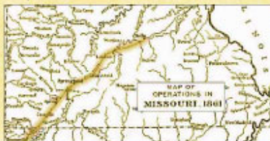
The Springfield and Wire Road

Pacific is famous for its association with America's mother road, Route 66. Before the age of automobiles this route to the southwest was known primarily as the Springfield Road. Before the Civil War, a military telegraph line was laid from Jefferson Barracks in St. Louis to Springfield, Missouri, then south to Fort Smith in Arkansas. Originally routed through Jefferson City, the telegraph was laid along the Springfield Road to support Federal troops advancing to Springfield in 1862. The road came to be known as the "Wire Road."