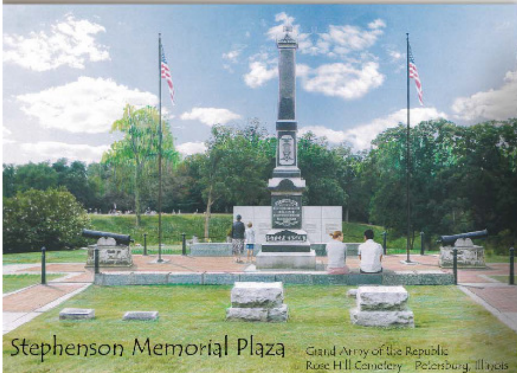
Stephenson Memorial Plaza Grand Army of the Republic Rose Hill Cemetery Petersburg, Illinois