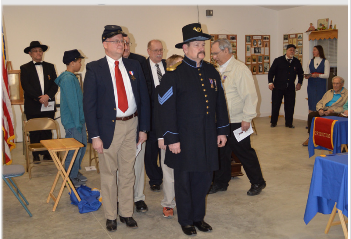
Ceremony at Wildwood.

Participants wore traditional Civil War clothing along with GAR insignias. The goal was to recreate a meeting to give the members of the Historical Society a feeling of what GAR members would do at their meeting. The event was appreciated by the Society as well as giving the Sons members an experience that was lived by their ancestors.