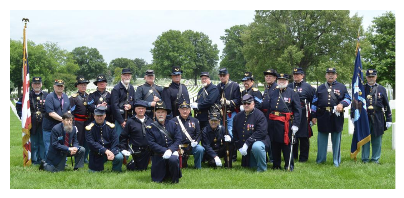
Members of the 4<sup>th</sup> Military District 12 June 2014 Civil War Veteran Memorial Ceremony Jefferson Barracks National Cemetery

Following units who are represented in this photo. 4<sup>th</sup> Military District Staff, 2<sup>nd</sup> Missouri Infantry, SVR; 5<sup>th</sup> Missouri Cavalry, SVR; 34<sup>th</sup> Illinois Infantry, SVR, 37<sup>th</sup> Iowa Infantry (Color Guard), SVR; 47<sup>th</sup> Missouri Infantry, SVR; 78<sup>th</sup> Enrolled Missouri Militia, SVR; Ships Company USS Carondelet, SVR; and members of the 17<sup>th</sup> Missouri Infantry Regiment, USA (Reenactors)