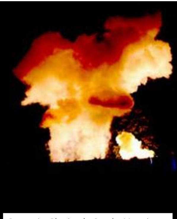
Reenacting Blowing the Powder Magazine in 2007