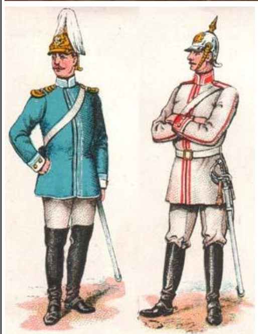
Sächsischer schwerer Reiter Preussischer Kürassier (Garde-Reiter).