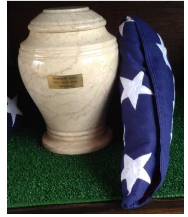
←37<sup>th</sup> Iowa Infantry Color Guard was the color guard for the Civil War procession.

On 12 June at approximately noon we started to