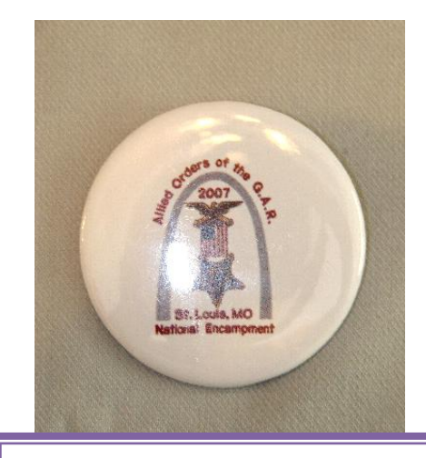
Encampment Pin -- Potential Recruiting Gift? -- 136 left. Lots of 25 for only $1.00 plus shipping of $6.00

If the editor has a question regarding the items for sale, he will contact the camp. The reason it says "No Raffles!" above is because they are technically illegal in the state of Missouri.